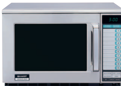
R-25JTF 2100 watts

We subject our heavy-duty ovens to the harshest, most critical, unmerciful testing – to ensure optimum performance and reliability. High-tech yet always high-touch, these structurally superior performers are perfect for high-volume food outlets. Choose from a wide range of powerful wattages. All have durable stainless interiors, sturdy grab-handles and hinges, plus the most sought-after time-saving features. Memory Programming, Double Quantity Pad, and Express Defrost™ eliminate guesswork and increase productivity. While Sharp's "top and bottom" energy distribution system ensures uniform heating and defrosting – regardless of where food is placed. They're even stackable – to expand capacity without taking up valuable counterspace.