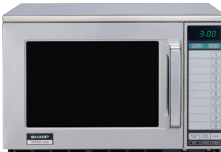
R-22GVF 1200 watts