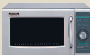
R-21LCF 1000 watts