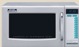
R-21LTF 1000 watts

Behold the future: A place where less is more and lighter is stronger. And faster. And smarter. Sharp's light-duty microwaves feature the indestructible quality and easy maintenance of stainless steel interiors. They resist pitting, chipping, scratches and corrosion. What's more, these cost-efficient models also have super-rugged grab handles, designed to withstand a lifetime of rough handling. Ideal for both foodservice and self-service operations, with a generous 1.0 cu. ft. capacity, they deliver 1000 watts of high-speed power for faster service. Plus an array of easy-to-use features and one-touch controls for mistake-proof microwaving. Just put in the food... push a button... done!