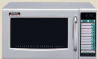
R-21LVF 1000 watts