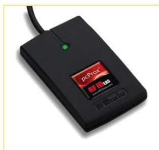
MX-SW100 works with Sharp OSA Partner Program Member card reader solution for convenient print release with ID card.