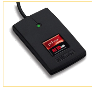
MX-SW100 works with Sharp OSA Partner Program Member card reader solution for convenient print release with ID card.