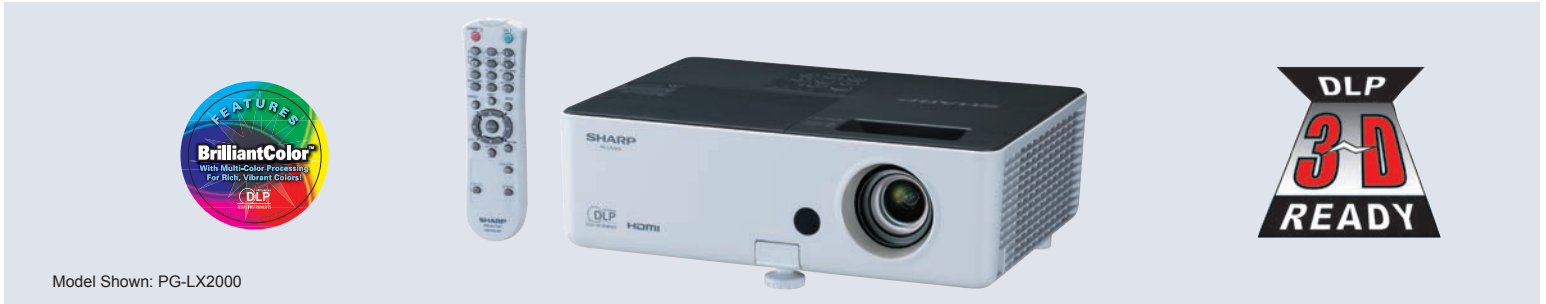
Model Shown: PG-LX2000

Portable and affordable, these 3D Ready BrilliantColor™ DLP® projectors deliver high image quality and superb reliability for classroom, meeting room and small office use. With 2,800 lumens and 2,000:1 contrast ratio, these models provide exceptionally vibrant and realistic image reproduction. The sealed DLP chip with filter-free design helps ensure low maintenance and operating costs. Built in an ISO 14001 certified factory with standby power consumption as low as 0.5W and estimated lamp life of up to 5,000 hours (in eco mode), these lightweight RoHS compatible projectors are an environmentally conscious choice.