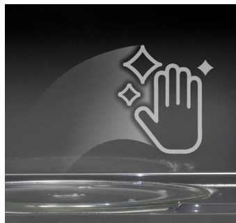
The Simply Better Clean interior provides a stain-resistant and easy-to-clean interior