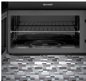
Chrome grill rack accessory included for multi-level cooking and reheating

The powerful, 2-speed ventilation system is effective up-to 300 cu. ft. per minute, and features easy-to-reach, easy-to-replace filters. The Simply Better Clean enamel coating inside the oven is stain resistant and wipes clean with a damp cloth. With decades of experience designing innovative cooking appliances, it's easy to see why cooks around the world trust Sharp.