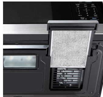
Easy-to-access, sliding grease filters allow for effortless, hassle-free replacement