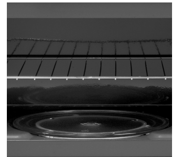
Recessed turntable with On/Off functionality creates an even cavity floor to accommodate cookware as large as 14" x 20"

Product specifications and design are subject to change without notice.