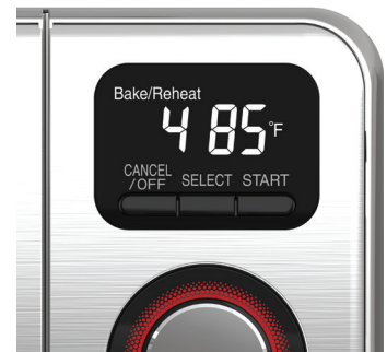
Easy-to-read display keeps you in control. Single dial control makes it easy to operate.