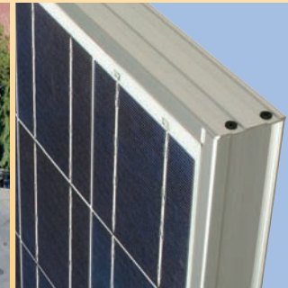
Improved Frame Technology