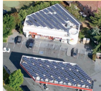
Sharp multi-purpose modules offer industry-leading performance for a variety of applications.

This module uses an advanced surface texturing process to increase light absorption and improve efficiency.