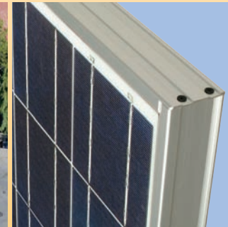
Improved Frame Technology