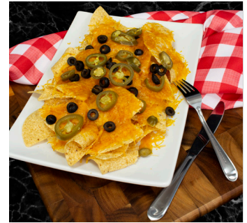
Sensor cook menu for precise cooking and reheating