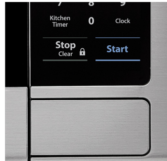
Handle-less, push door modern design matches all styles of kitchens